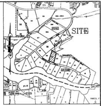
VICINITY MAP SCALE: 1" = 1000'